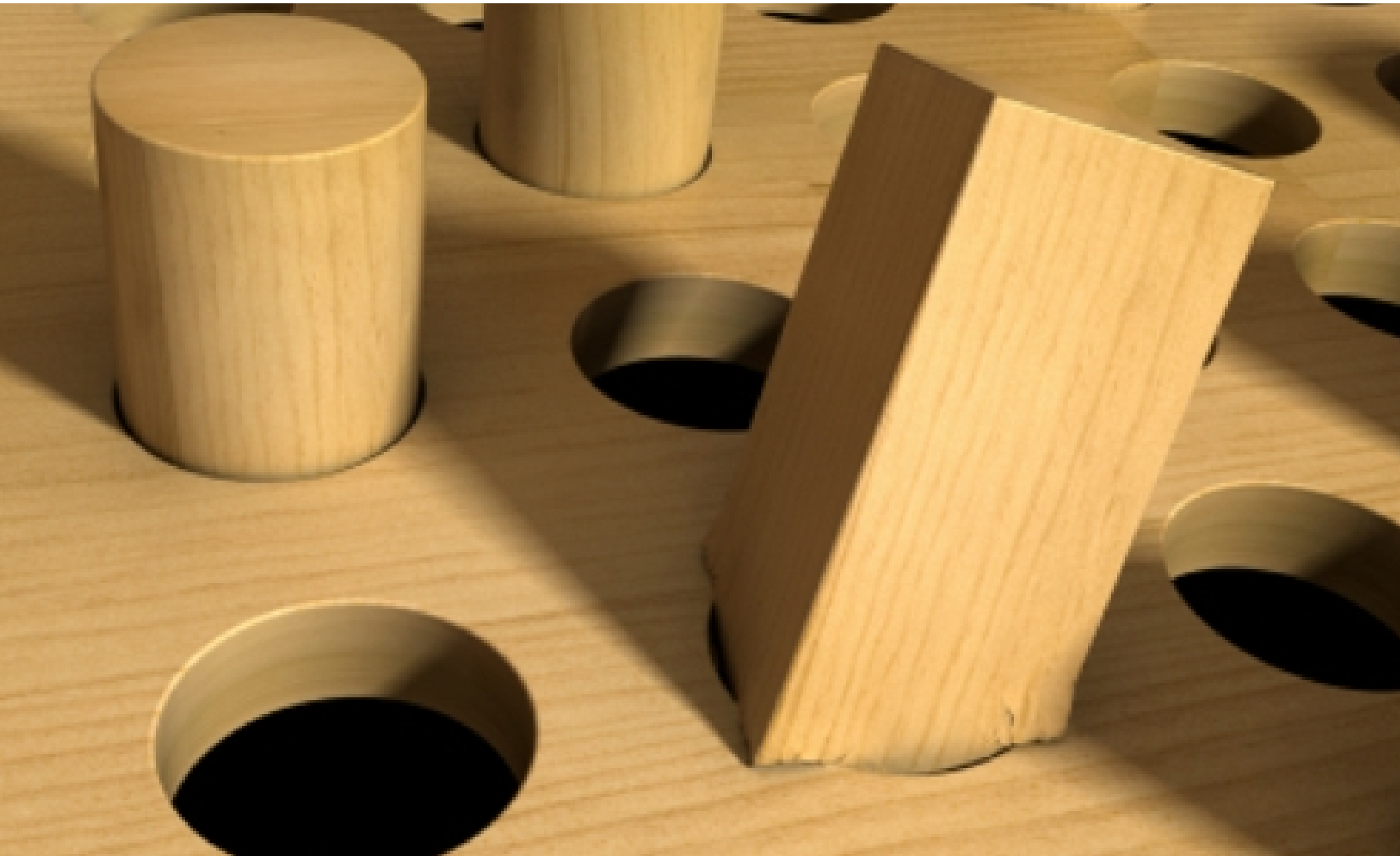
(17) The Misfits