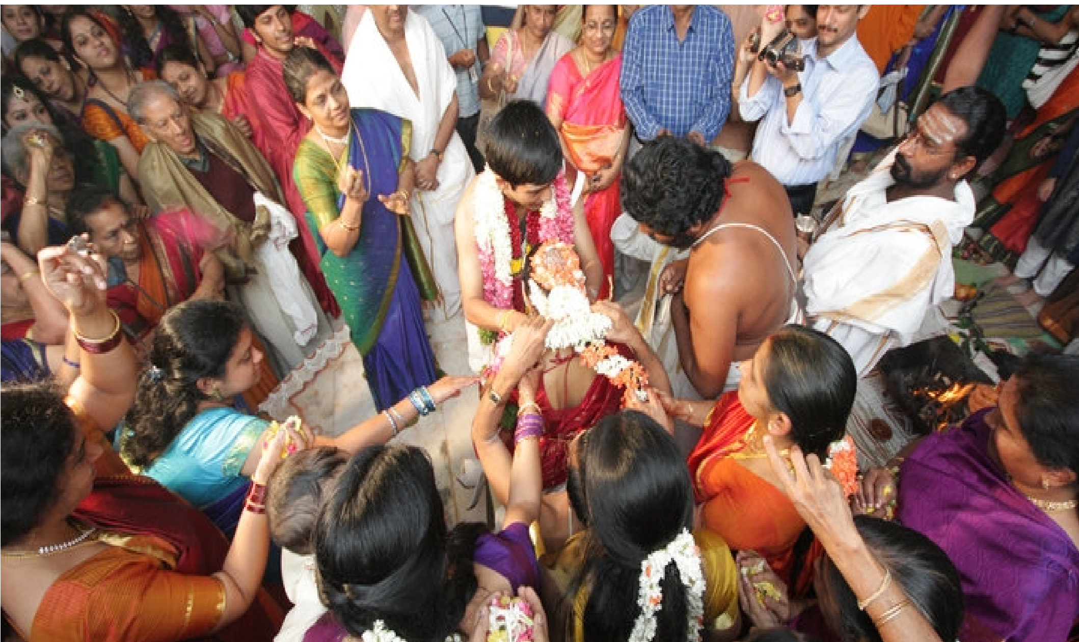
(28) Mayhem at the Marriage Hall!